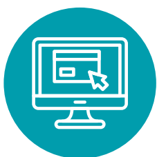
Online, digital and electronic arts