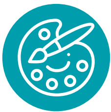
Visual arts, design and craft

The Health Evidence Network (HEN) synthesis report on arts and health, which will be launched on 11 November 2019 , maps the global academic literature on this subject in both English and Russian. It references over 900 publications , including 200 reviews covering over 3000 further studies . As such, the report represents the most comprehensive evidence review of arts and health to date.